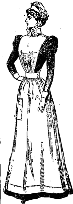
The "Rena" Apron. Made of linen finished Cloth lock-stitch throughout, 2/8 each. In two sizes, 36 in. & 39 in. from waist to hem.