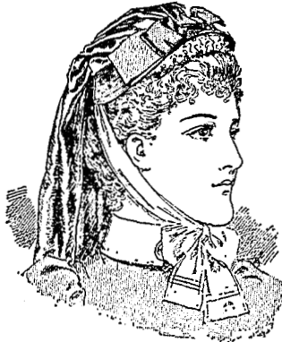
The "St. Bride's" Bonnet. Made of fine Straw with Lace and ruching, and trimmed with Ribbon, and long Silk Gossamer Fall. In black and colours, 12/6 each. Without Fall, 9/6; also The "St. Clare" Bonnet. 6/11 complete.